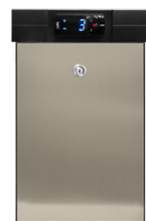
Smart Fridge Temperature sensor. Milk level sensor. Up to 9 litres in deposit.