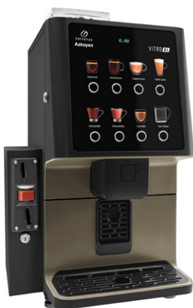
Validator module kit Ready to install a coin validator.

Vitro S1 is the perfect solution for convenience stores, service stations, hotels and restaurants where service needs to be intuitive and fast, with a daily consumption of up to 80 cups. It is also the perfect solution to promote a cooperative culture in offices of up to 40 employees, offering high quality fresh milk-based coffee beverages and a premium user experience.